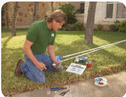
Take your F5 with you no matter where your work takes you.

No longer do you have to sacrifice size and weight for outstanding performance. Weighing approximately 3 pounds with an integrated handle, this ergonomic tool is ideally suited to complement your demanding work day. The Motion F5 Tablet PC offers true mobility with Intel® Centrino® processor technology and optional integrated wireless broadband technology.