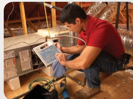
Easily clean the durable F5 while working in harsh environments.

The Motion F5 features a built-in camera, a standard Radio Frequency (RFID) reader and a barcode scanner to document and diagnose work day problems. Scan tagged equipment to determine model and specification information and photograph your project before and after to document work. Coordinate numerous subcontractor jobs on site without worry of harsh conditions like dust, dirt and moisture. The durable, quick cleaning design of the F5, which is IP54 rated, gives you confidence to do your job in any situation.