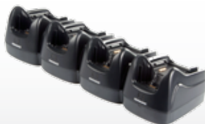
• 94A150037 4-Slot Charging Dock • 94A150038 4-Slot Ethernet Dock