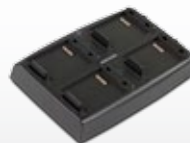
• 94A150039 4-Slot Battery Charger