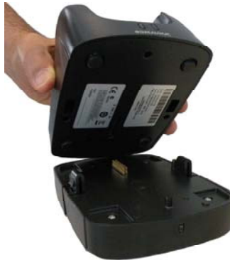
Figure 2 – Single Slot Dock Modem Module Installation