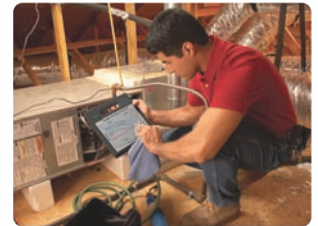
Easily clean the rugged F5v while working in harsh environments.

The Motion F5v comes standard with Gorilla™ glass , offering up to four times the strength in breakage resistance 3 , perfect for real-world mobile work environments. Add 180-degree viewing angles , Hydis AFFS+ LED backlit display and View Anywhere® technology for reduced reflectance and glare and you get the best tablet PC viewing experience available for outdoor use. Improved battery life over typical displays and an extremely damage-resistant surface make the Motion F5v tough enough to withstand your work environment and powerful enough to get the job done.