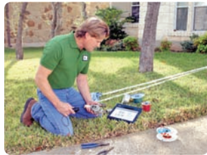
Take the F5v with you no matter where your work takes you.

Don't worry. The F5v brought its hard hat. Tested and proven to withstand field-ready conditions such as dust, heat and rain, the Motion F5v is ready to work wherever you're working. The strong internal magnesium frame, shock mounted display and hard disk drive (HDD) or optional solid state drive (SSD) protect against drops and bumps. Fully-sealed, the F5v is protected against the elements and easily cleaned.