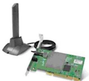
Figure 1. The Cisco Aironet 802.11a/b/g Wireless PCI Adapter

The low-profile form factor and two-meter cable length provide significant flexibility for installation in low-profile devices, such as slim desktops and point-of-sale (POS) devices. For versatility, both a low profile and a standard profile bracket frame are included with the adapter. The attached dual-band, 2.4/5-GHz, 1-dBi effective gain antenna has a two-meter cable that enables optimal placement for maximum performance.